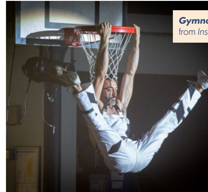
Gymnophonies • bespoke show, 2023 from Instrument / Monument

Commissioned by the Department of Cher as part of the new sound tour at the Noirlac Abbey, Centre Culturel de Rencontre.