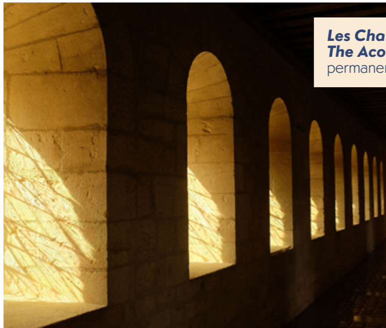
Les Chambres aux Acousmates The Acousmatic Sound's Rooms permanent, immersive sound installation, 2024

Décor Sonore is thus involved in producing works at the intersection of permanent installations, staged visits, and immersive experiences, ranging from the initial concept to the technical installation. Its creations are particularly well-suited for enhancing heritage sites, whether historical, contemporary, or undergoing transformation.